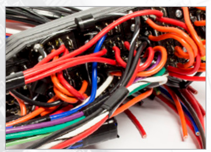
Before: Bundled random relays and a multitude of tangled wires.